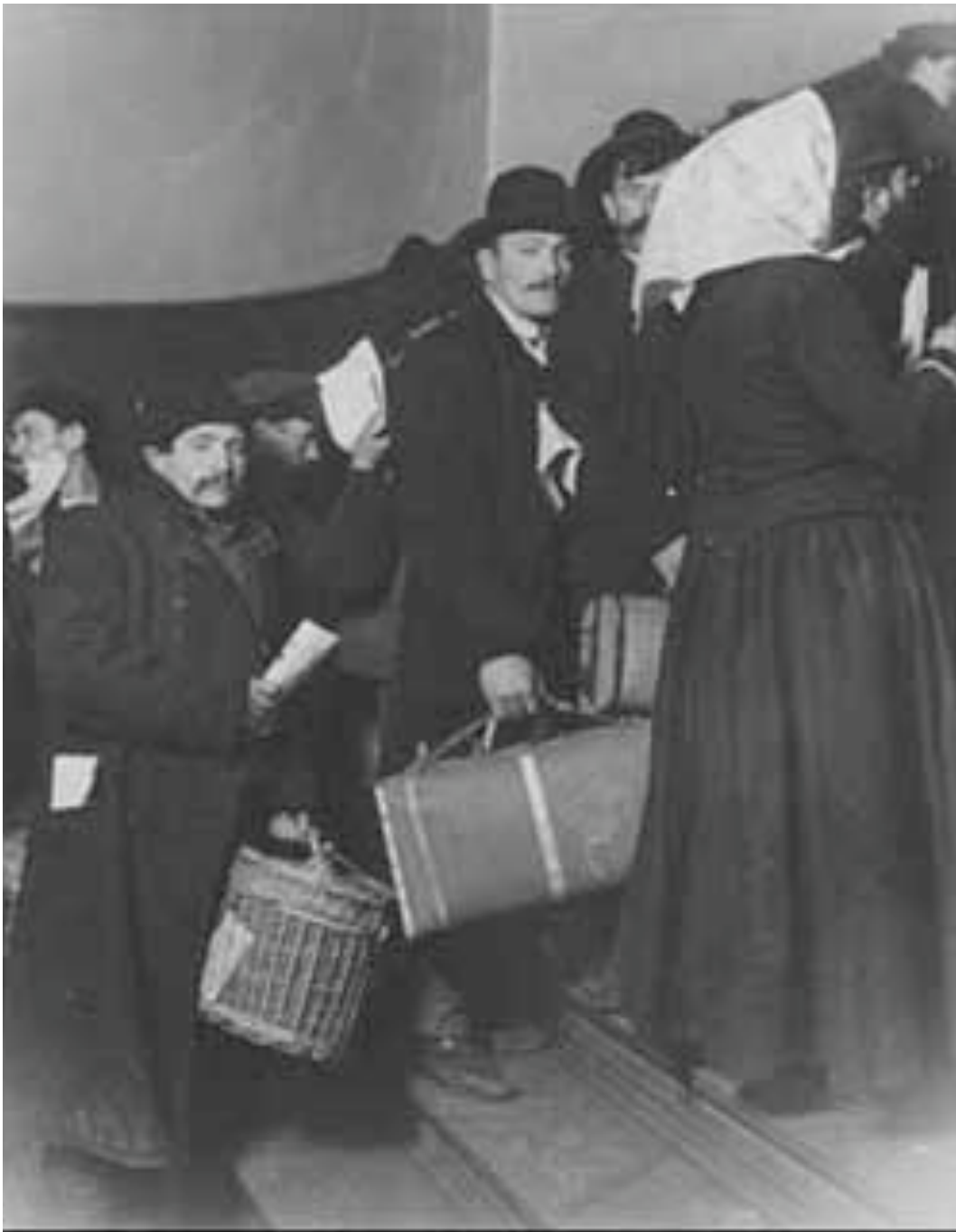
Climbing into America, Arrival at Ellis Island