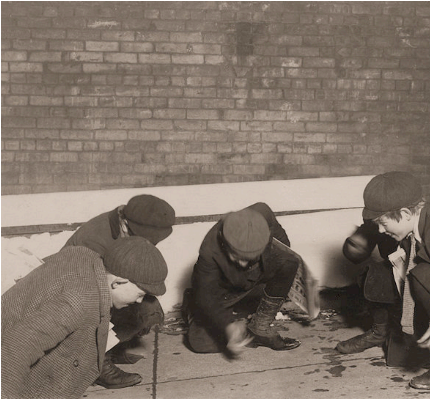
A group of newsies playing craps in the jail alley at 10 p.m. Albany, New York.