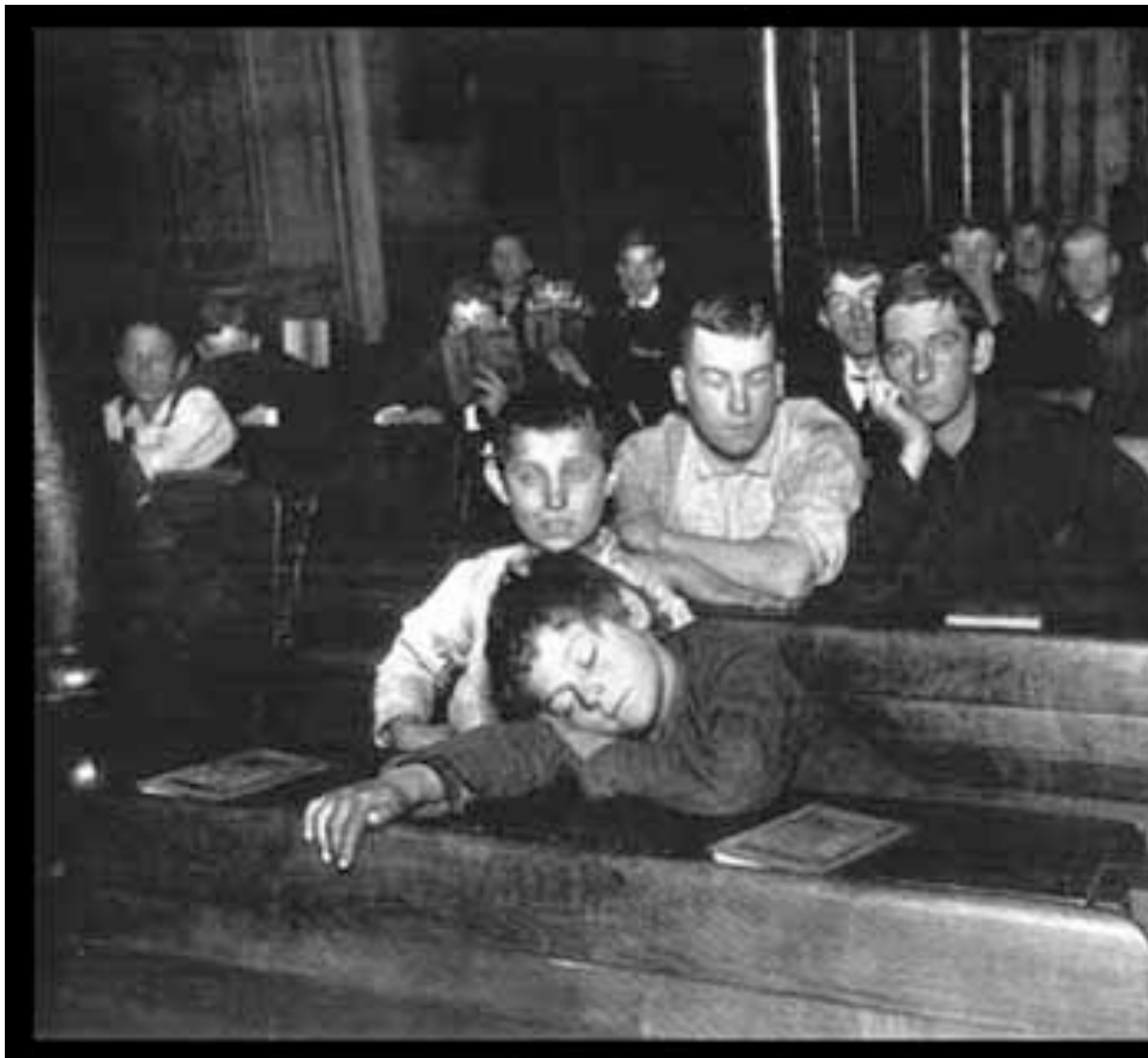
Night School at Seventh Avenue Lodging House