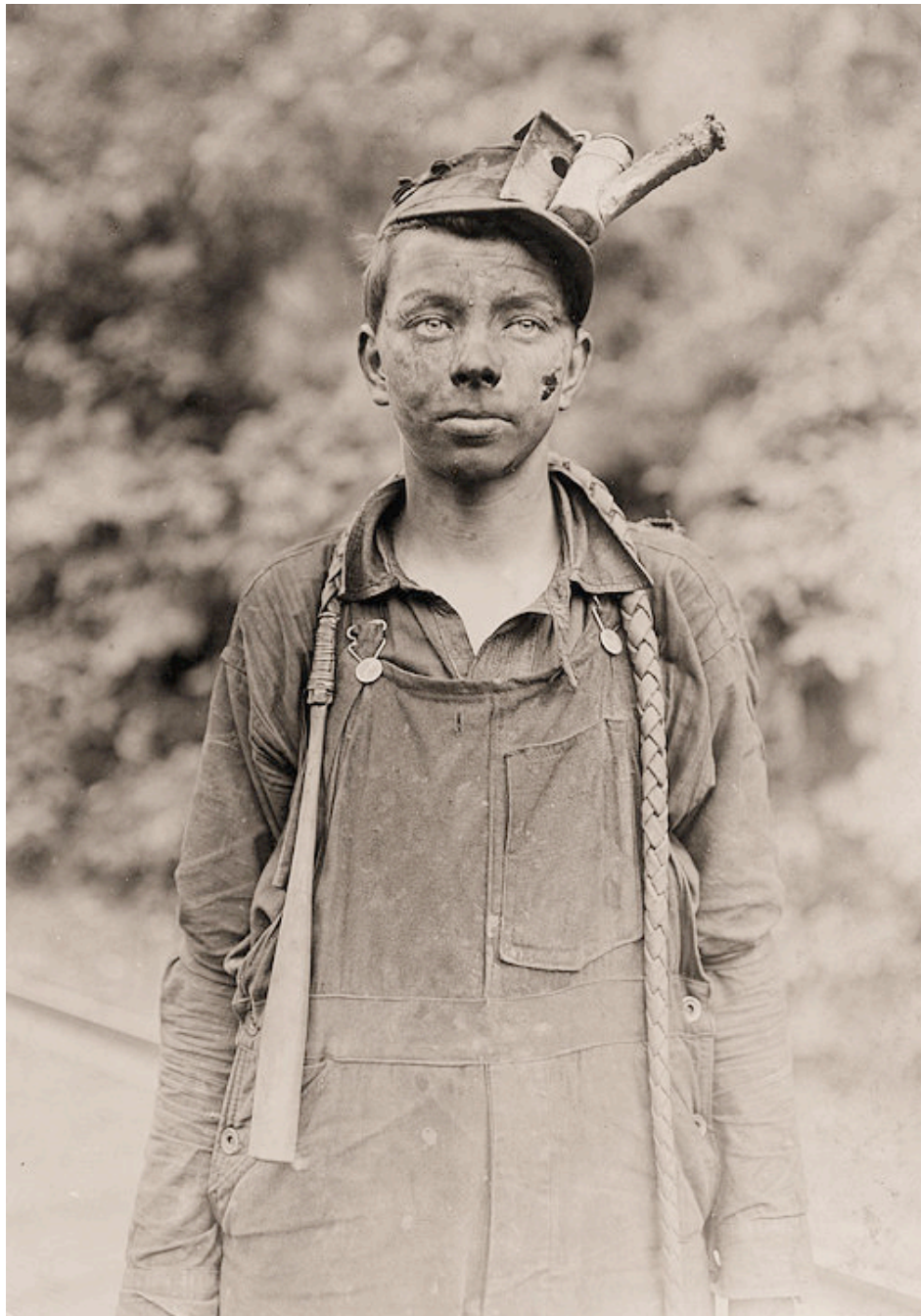
A young driver in the Brown Mine. Has been driving one year. Works 7 a.m. to 5:30 p.m. daily. Brown, West Virginia