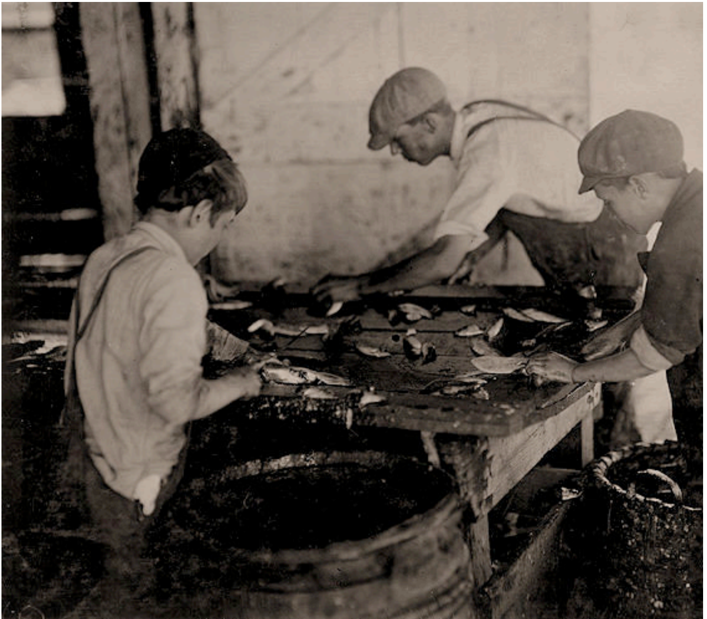
Cutting fish in a sardine cannery. Large sharp knives are used with a cutting and sometimes chopping motion. The slippery floors and benches and careless bumping into each other increase the liability of accidents. "The salt water gits into the cuts and they ache," said one boy. Eastport, Maine.