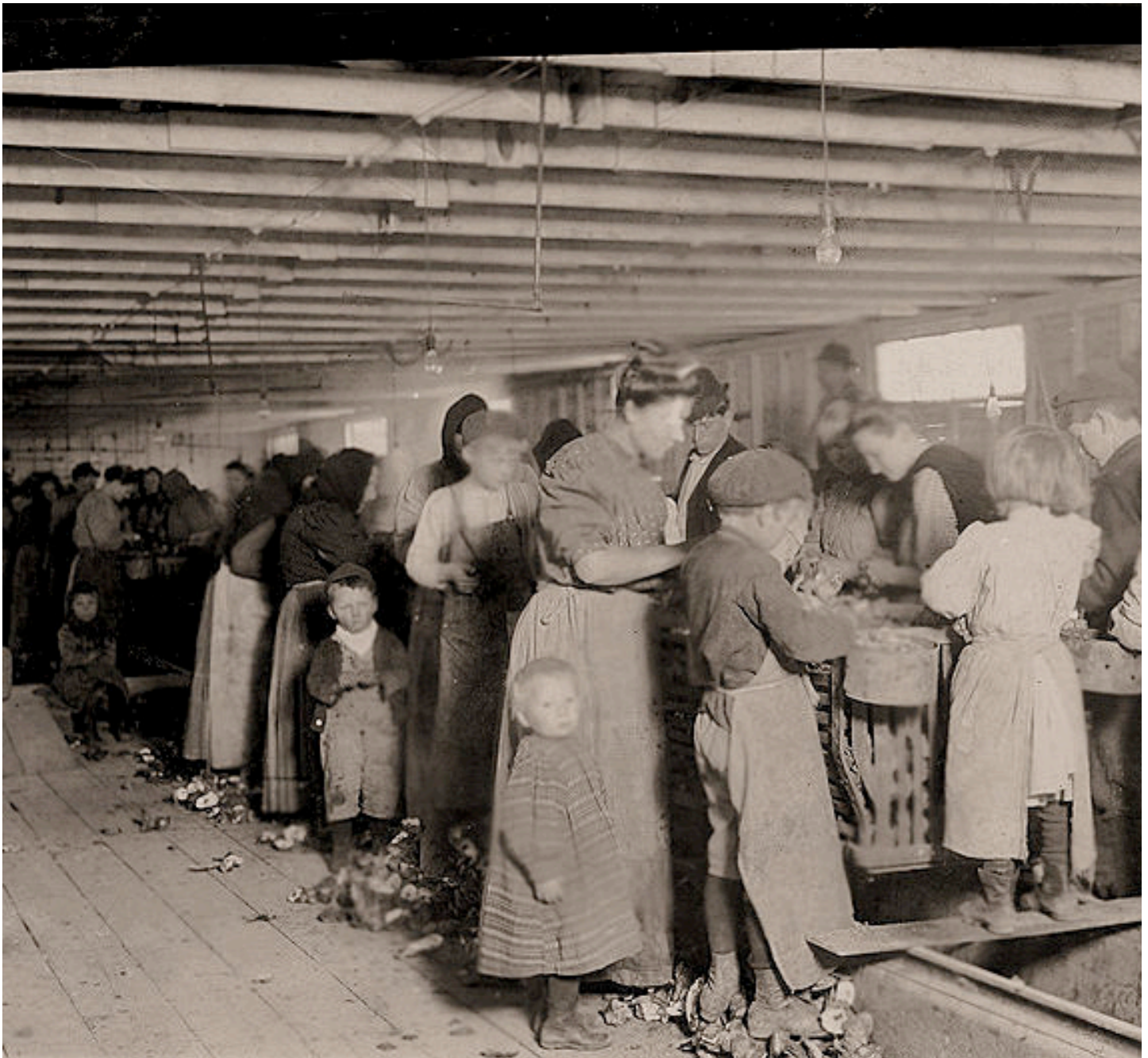
Oyster shuckers working in a canning factory. All but the very smallest babies work. Began work at 3:30 a.m. and expected to work until 5 p.m. The little girl in the center was working. Her mother said she is "a real help to me." Dunbar, Louisiana.