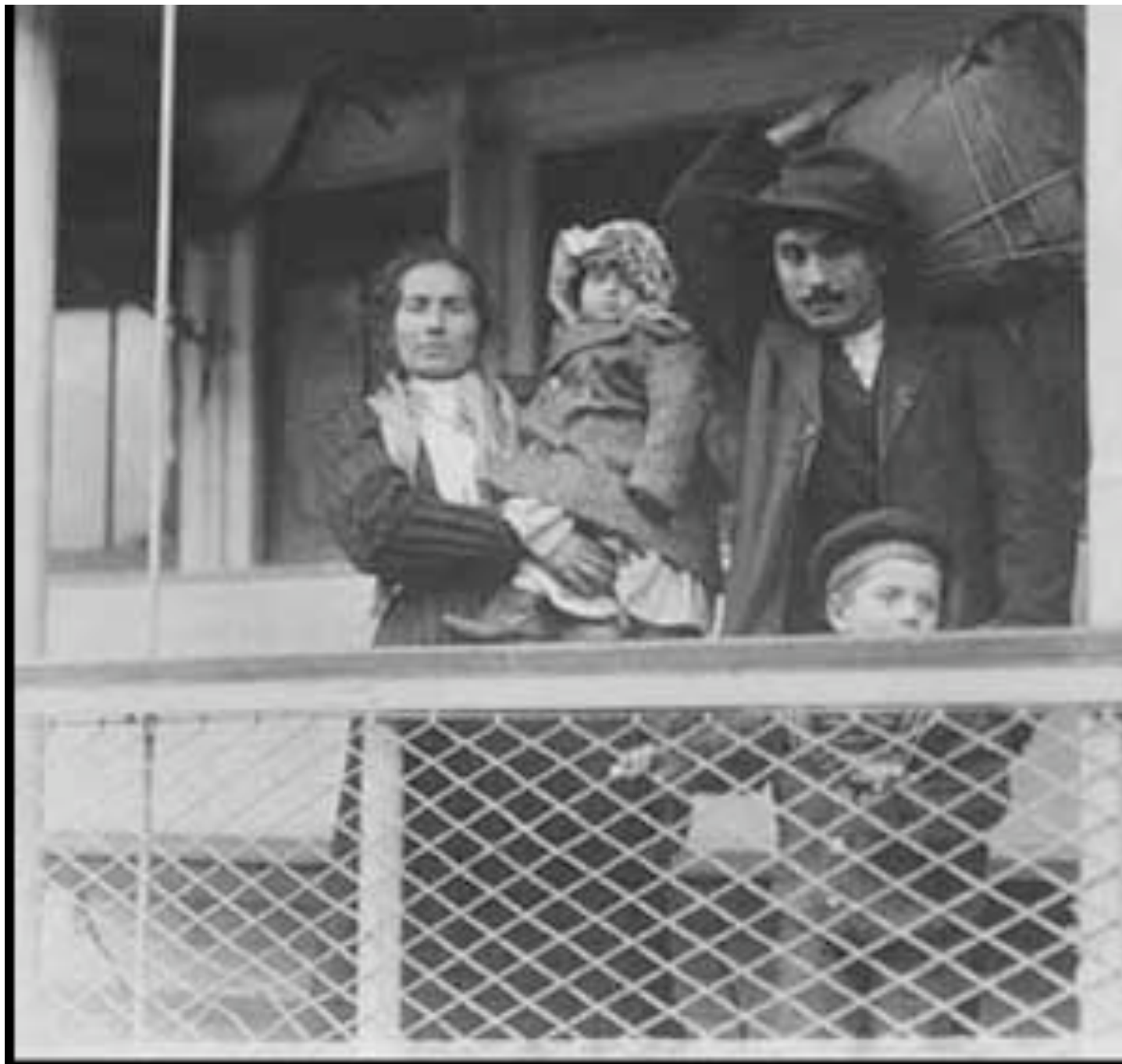
Italians arriving at Ellis Island