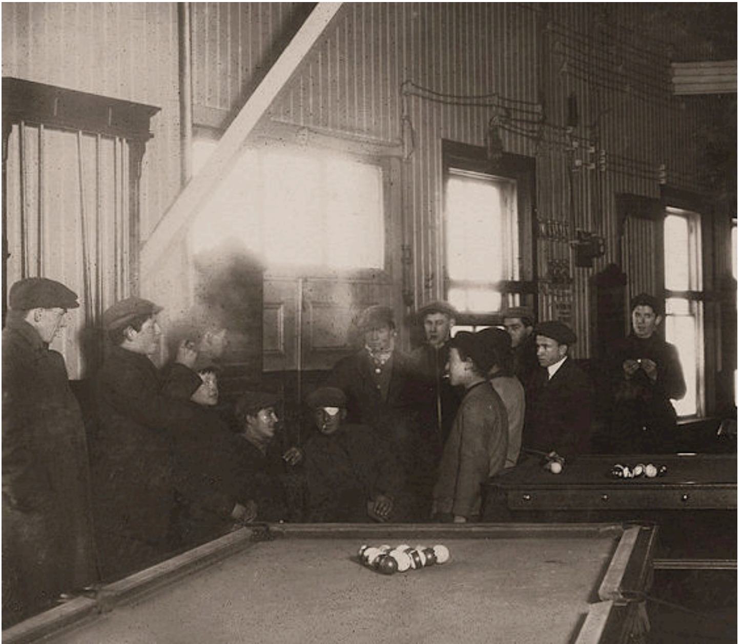
Killing time. Mill boys and men hanging around Swift's Pool Room. Saturday p.m. A common sight any day. Educational influences; bad stories and remarks - will not bear repetition. Fall River, Massachusetts.