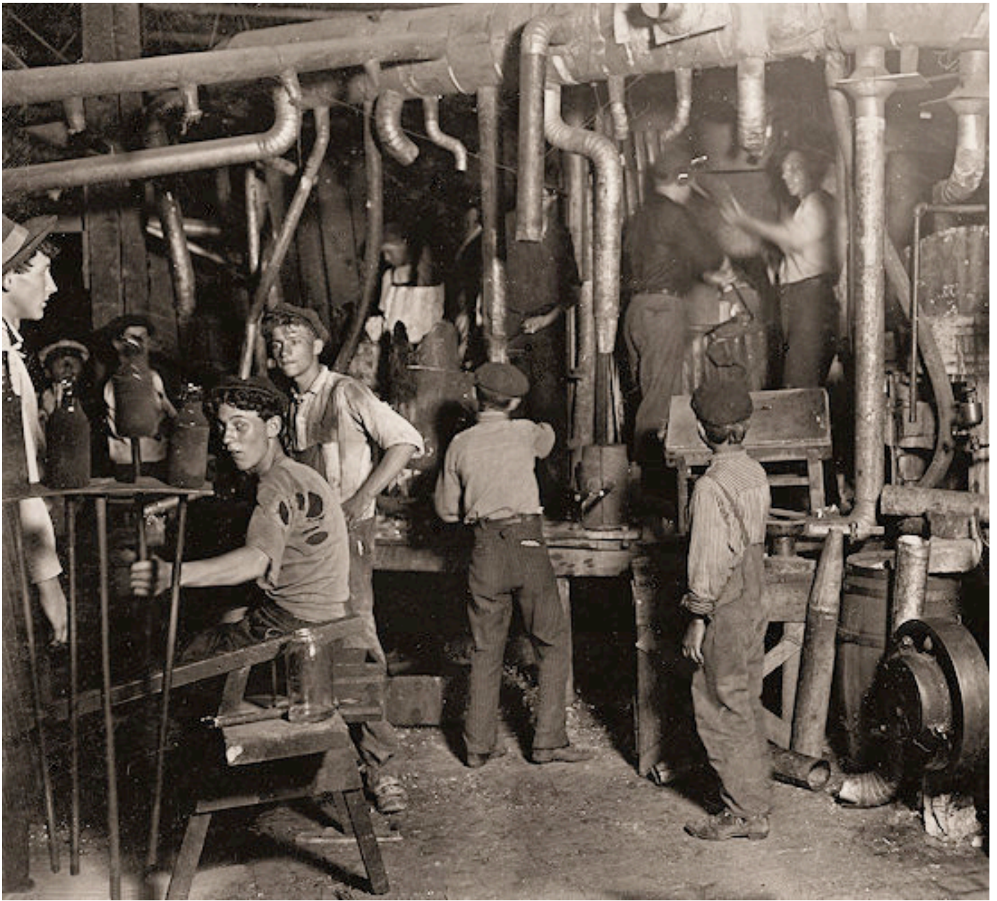
9 p.m. in an Indiana Glass Works.