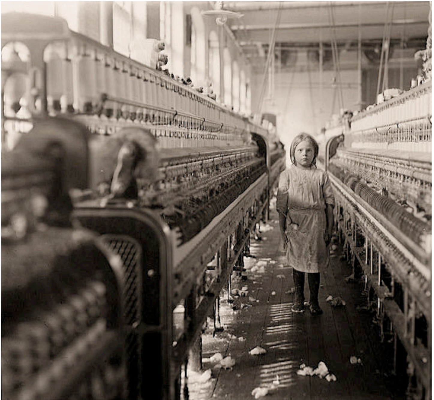
The overseer said apologetically, "She just happened in." She was working steadily. The mills seem full of youngsters who "just happened in" or "are helping sister." Newberry, South Carolina.