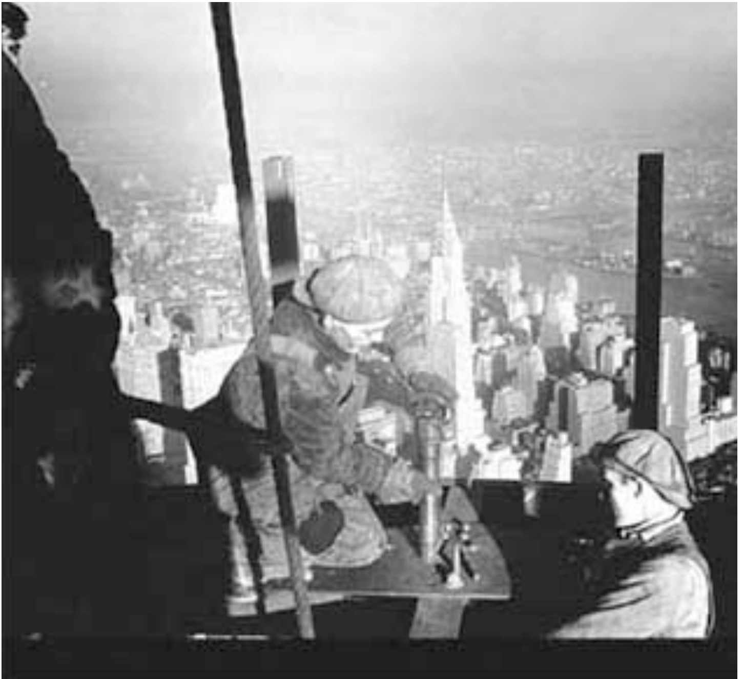
Riveting at the top of the Mooring Mast on Empire State Building