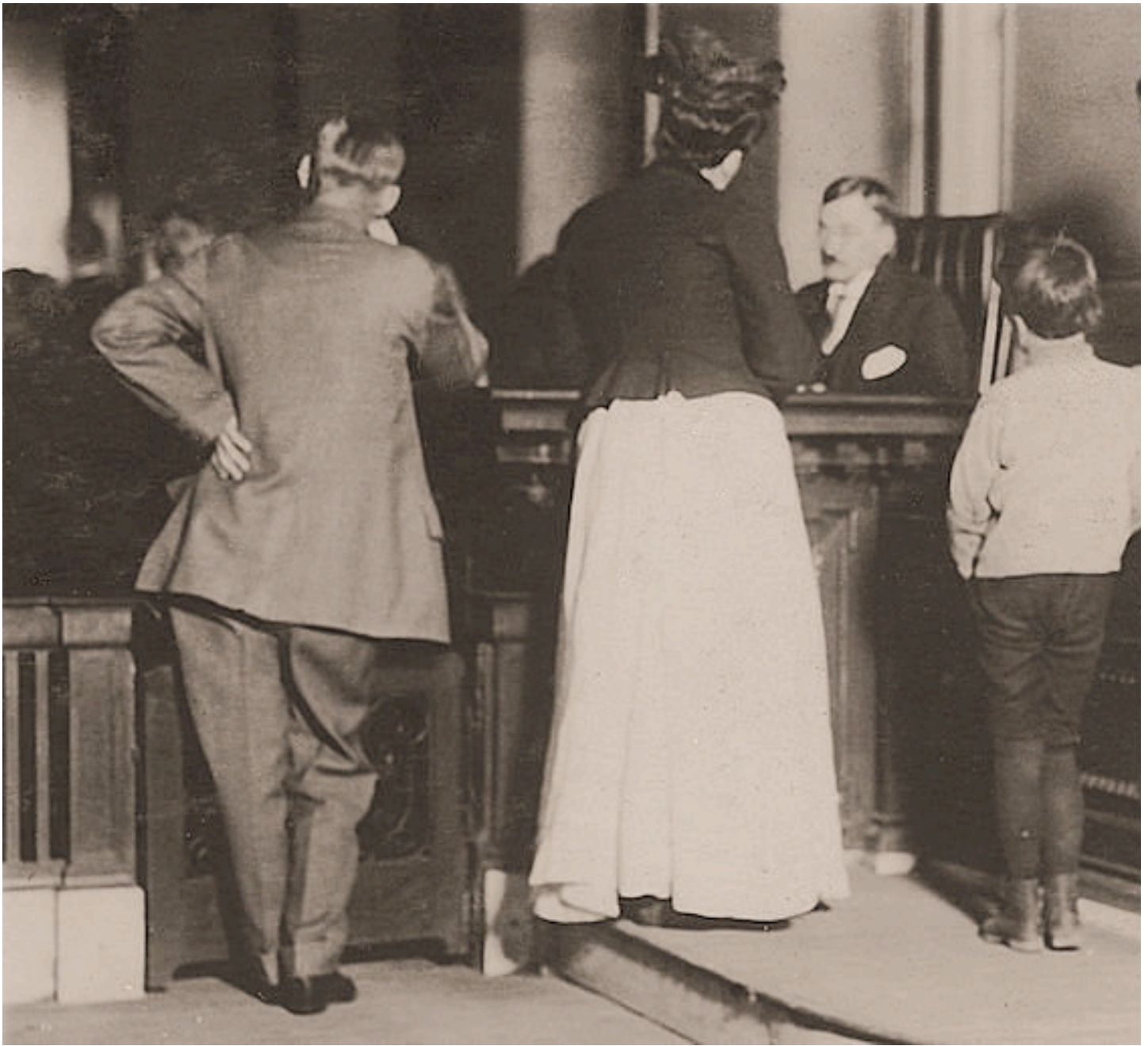
Juvenile Court. An 8-year-old boy charged with stealing a bicycle. St. Louis, Missouri.