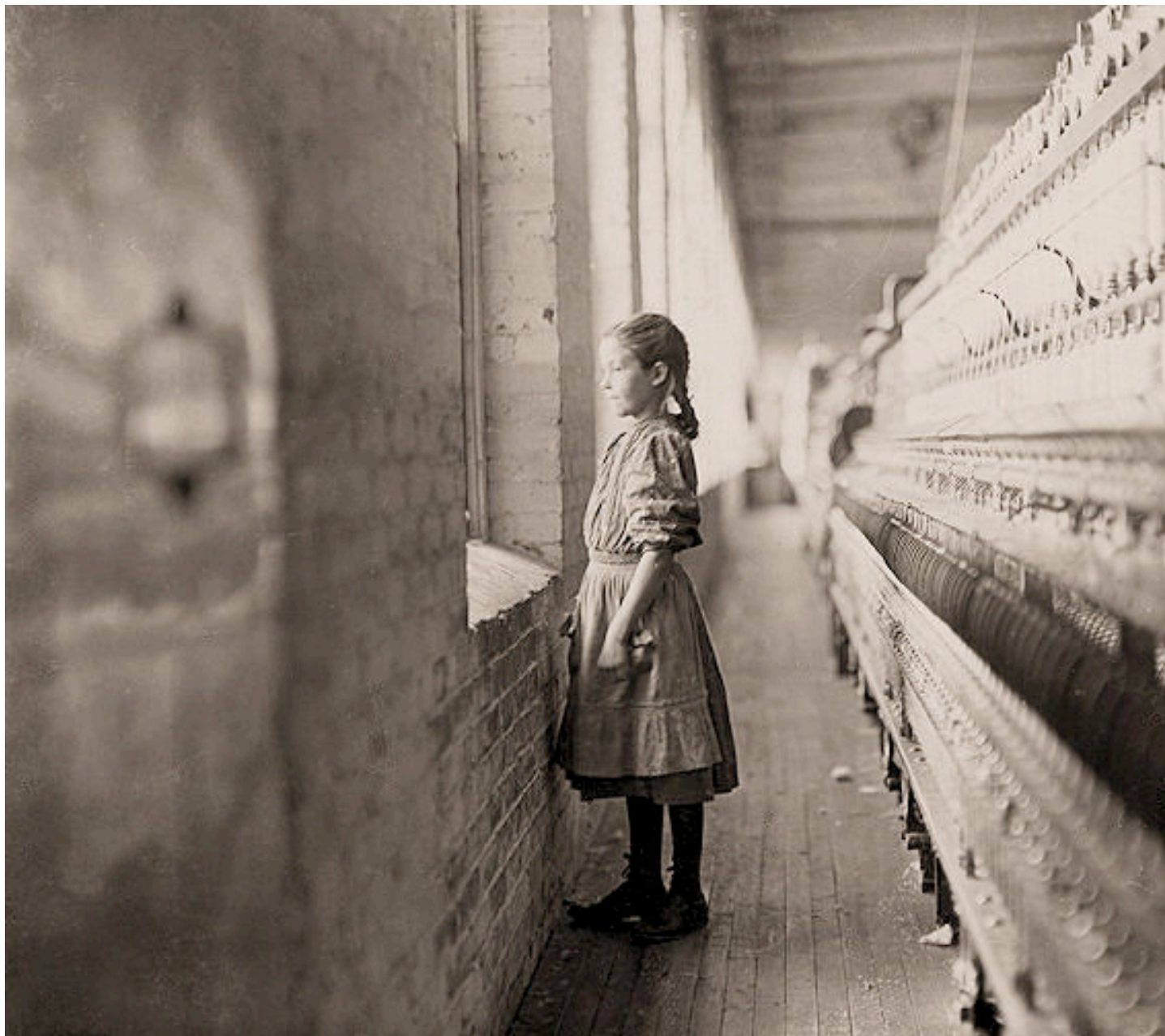
A moment's glimpse of the outer world. Said she was 11 years old. Been working over a year. Rhodes Mfg. Co. Lincolnton, North Carolina.