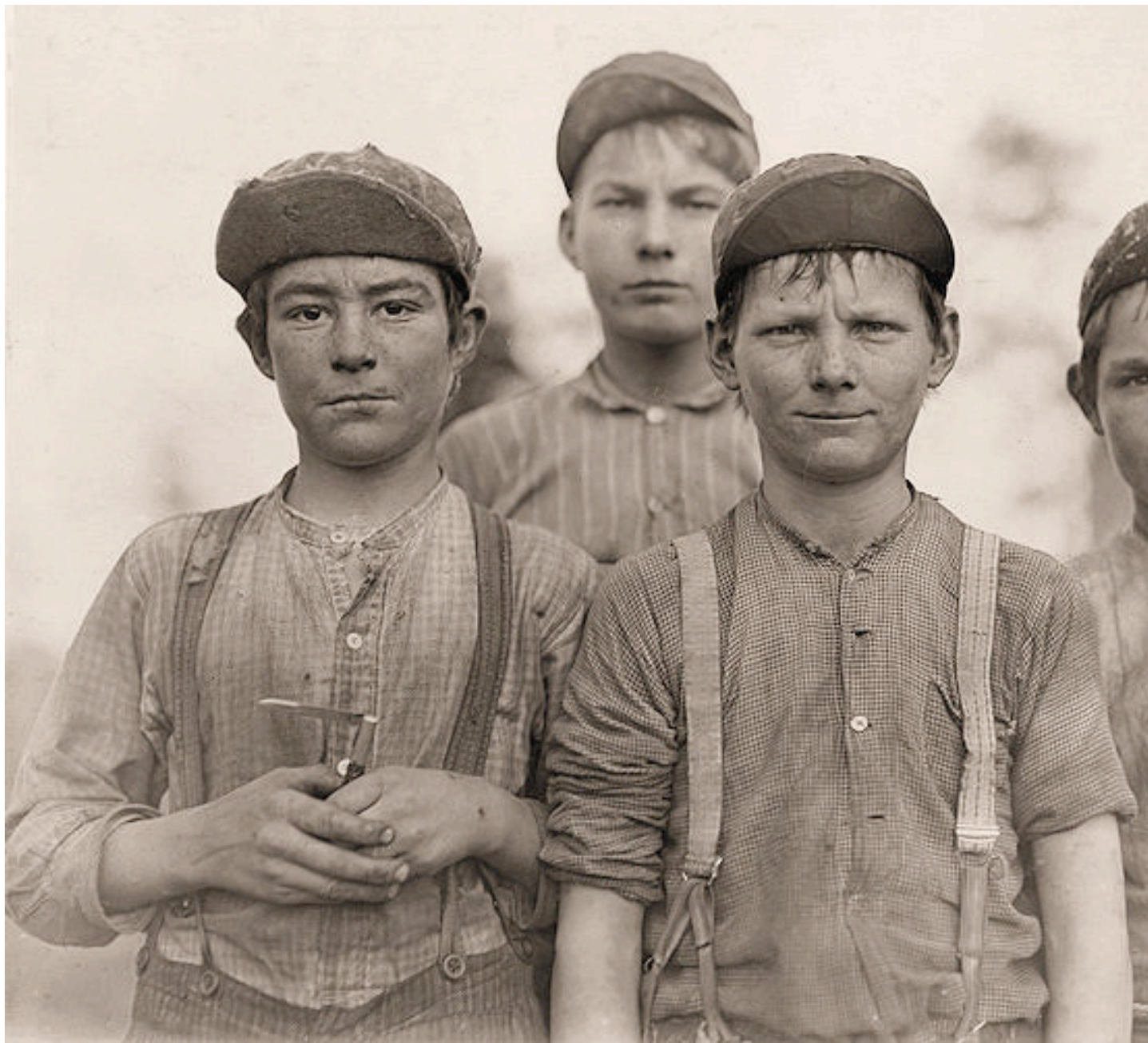
Doffer boys. Macon, Georgia.