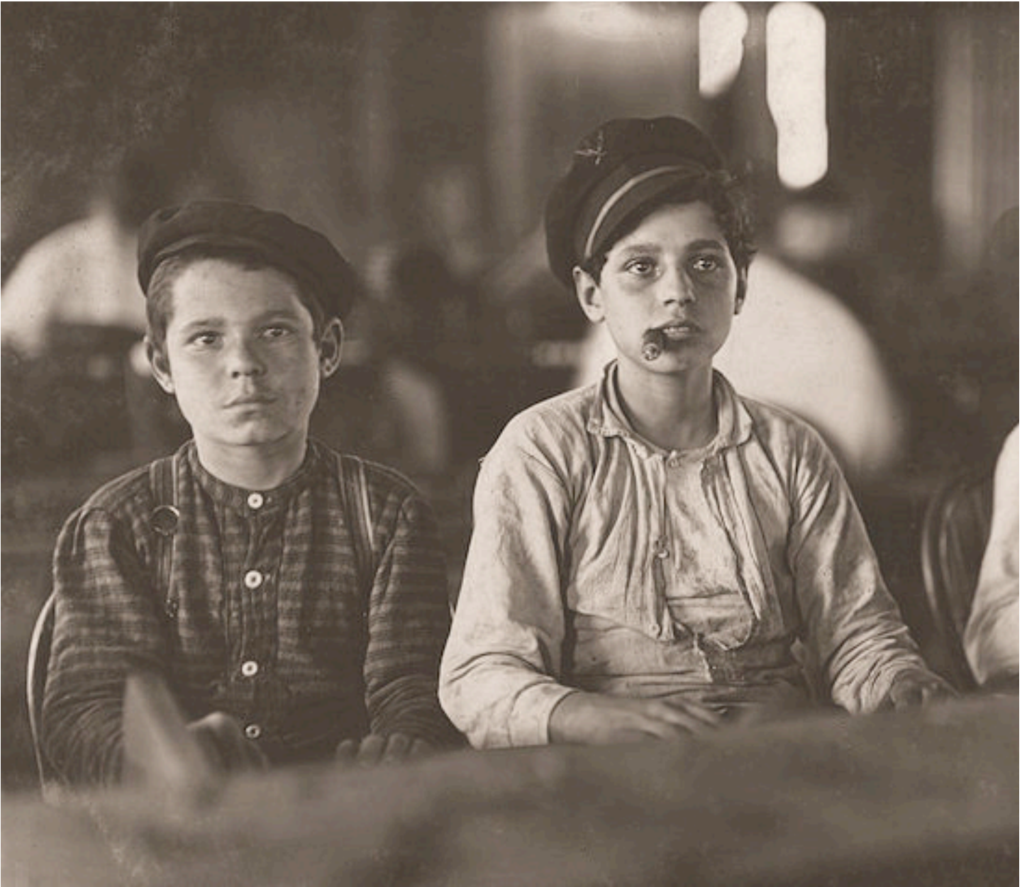
Young cigar makers in Engelhardt & Co. Three boys looked under 14. Labor leaders told me in busy times many small boys and girls were employed. Youngsters all smoke. Tampa, Florida.