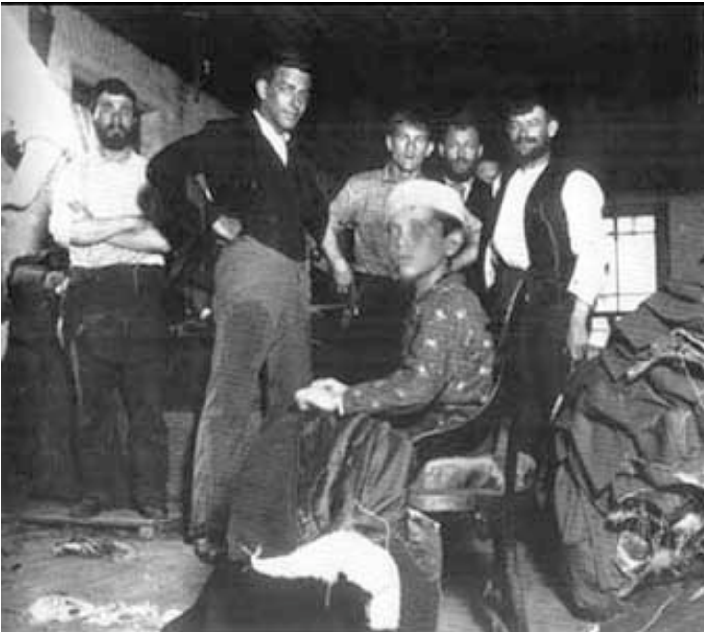
In a Sweat Shop