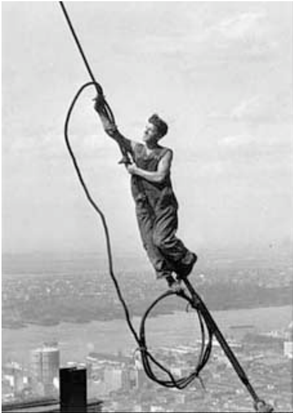
Icarus atop Empire State Building