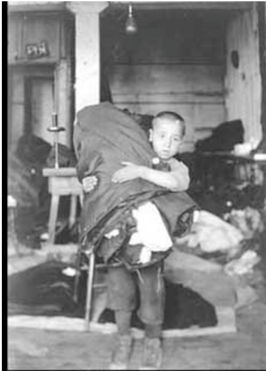
Boy carrying homework from New York Sweatshop