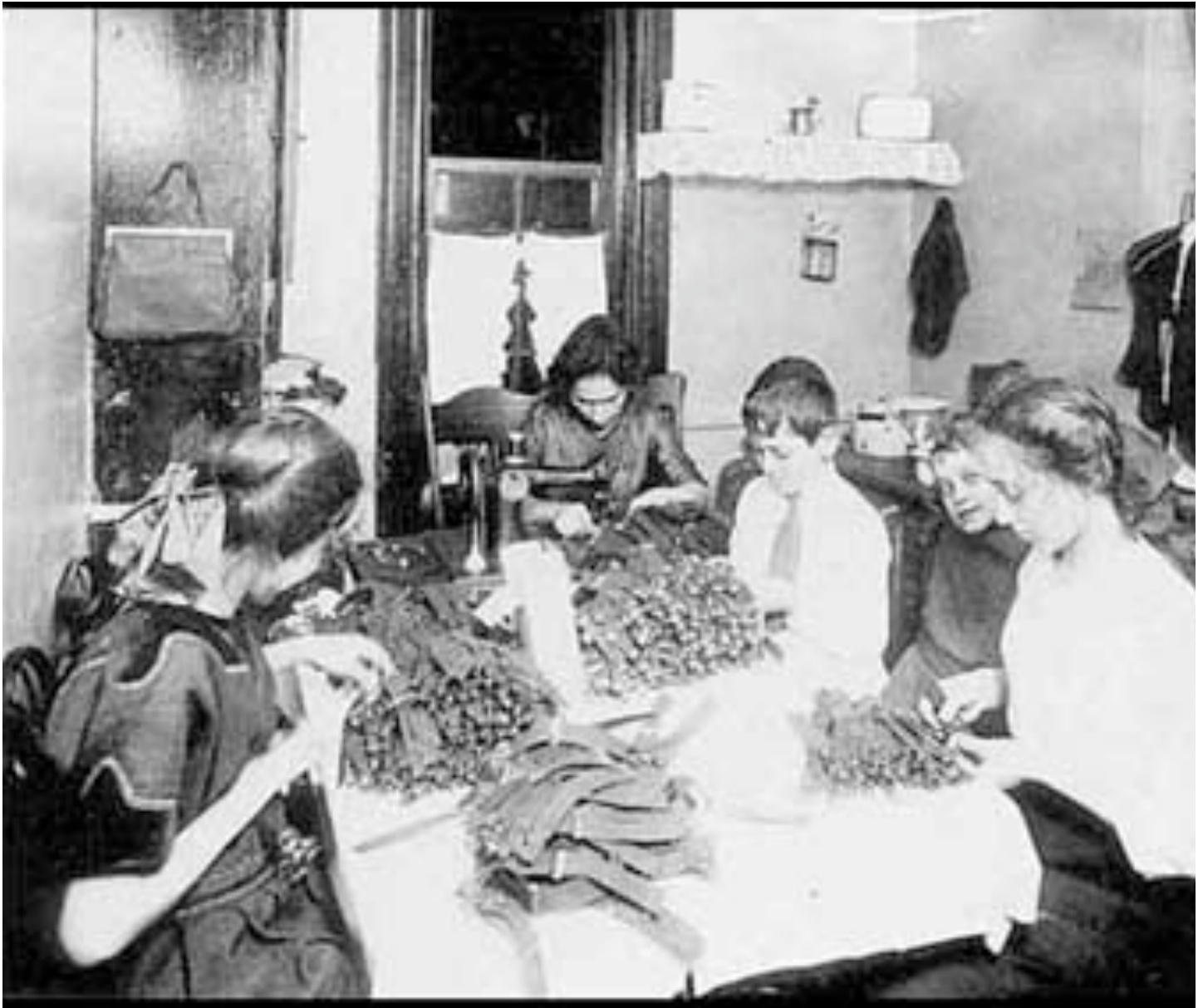
Adolescents working at home