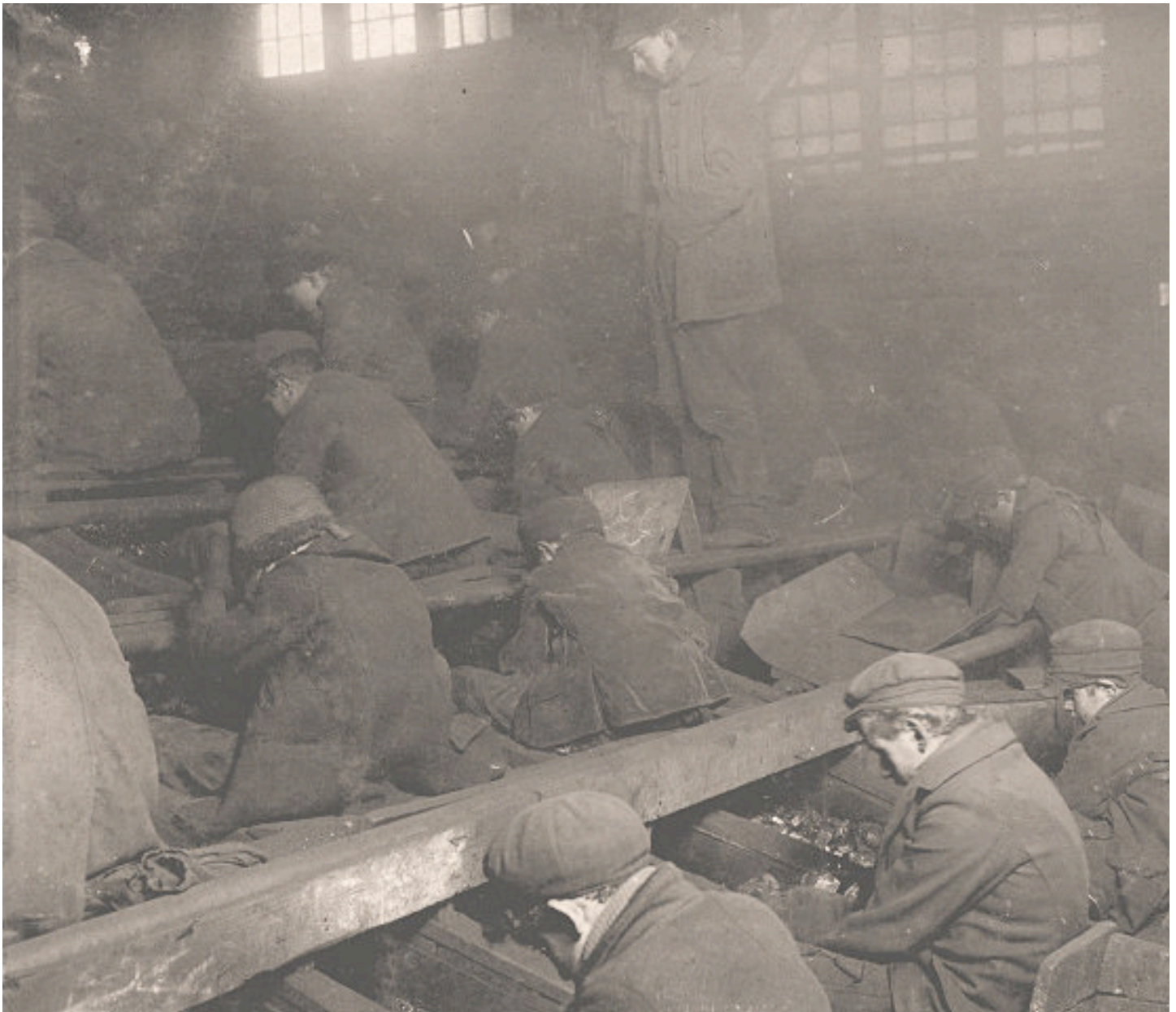
View of the Ewen Breaker of the Pennsylvania Coal Co. The dust was so dense at times as to obscure the view. This dust penetrated the utmost recesses of the boys' lungs. A kind of slave-driver sometimes stands over the boys, prodding or kicking them into obedience. South Pittston, Pennsylvania.