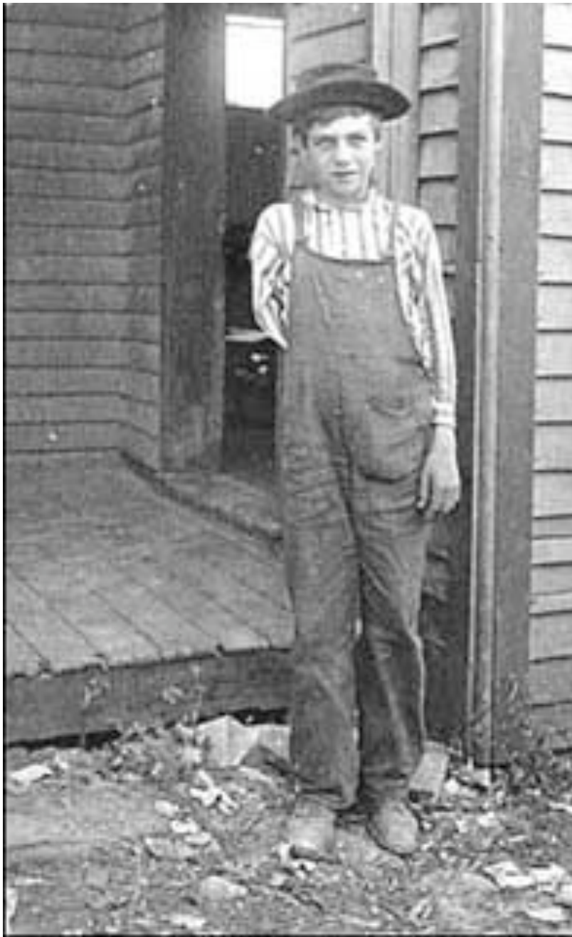
Boy lost arm running saw in box factory