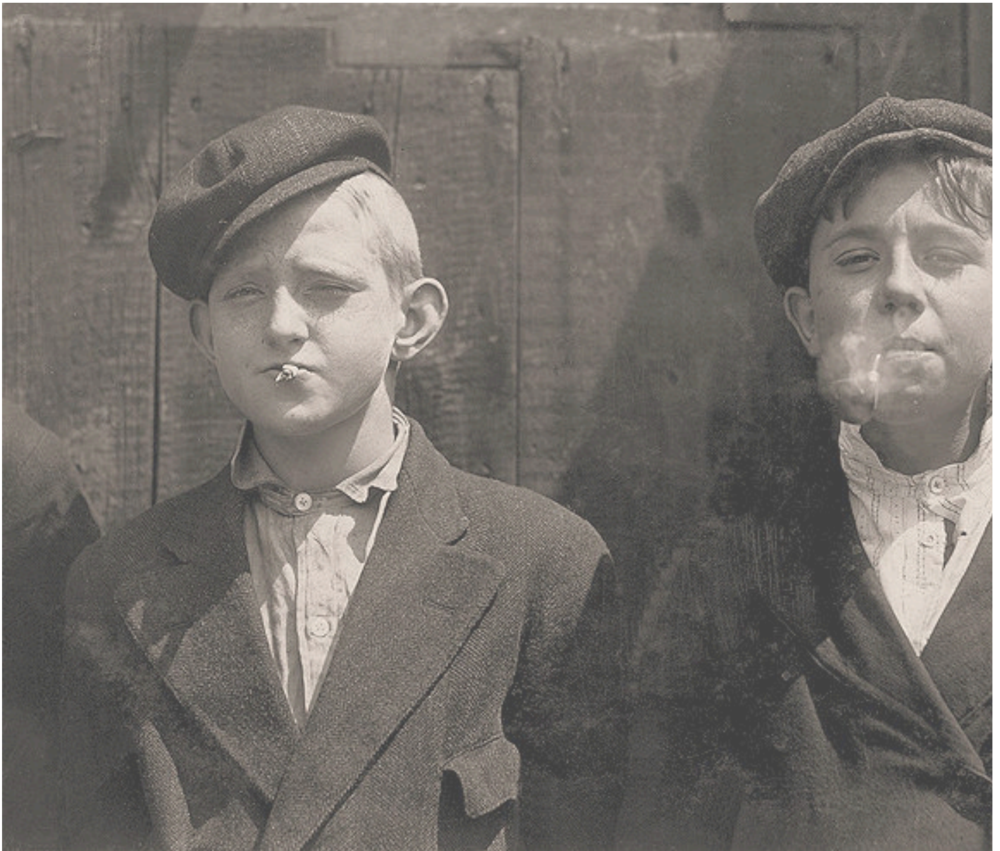
11:00 a.m. Newsies at Skeeter's Branch. They were all smoking. St. Louis, Missouri.