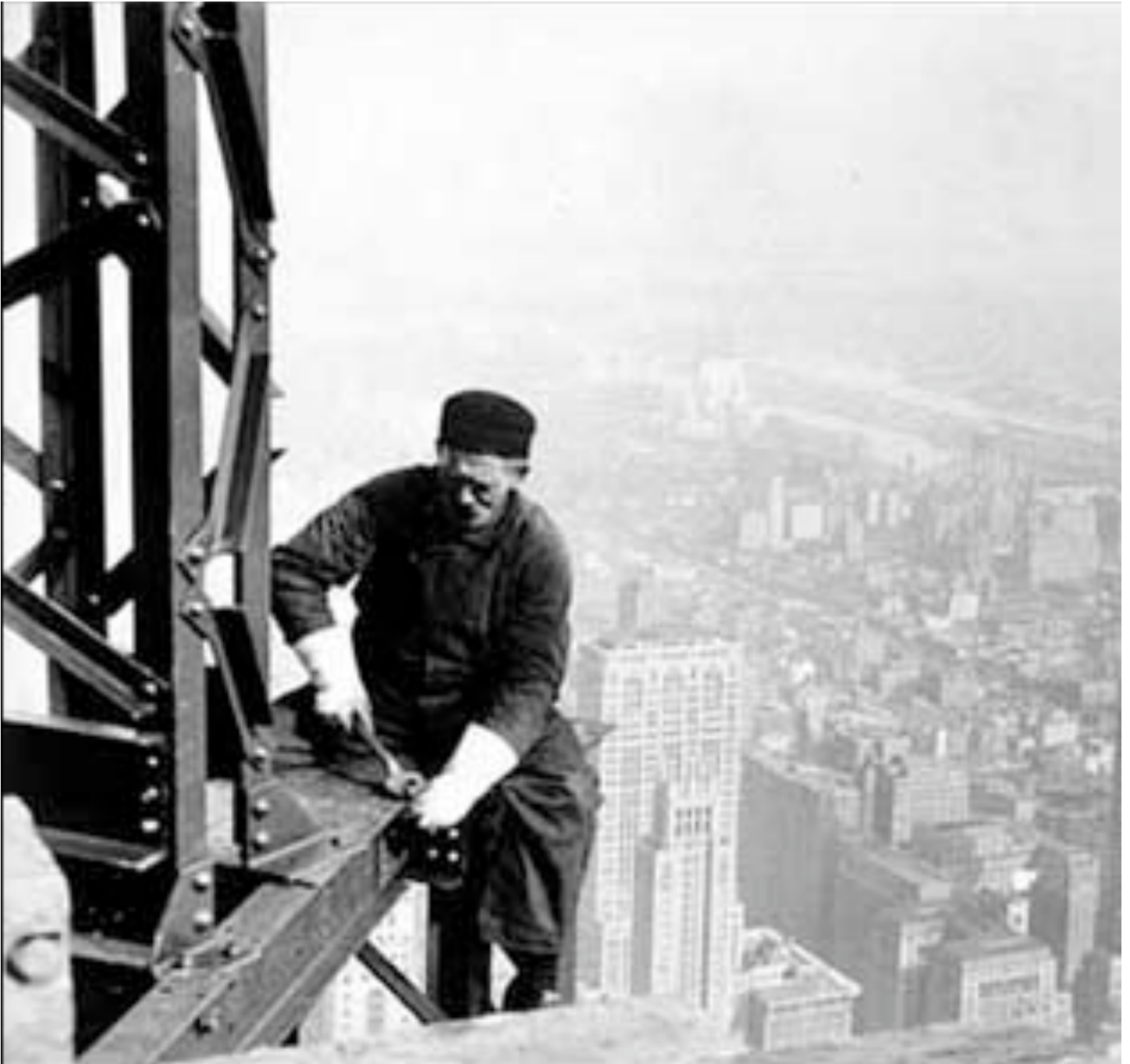
Old time steel worker on Empire State Building