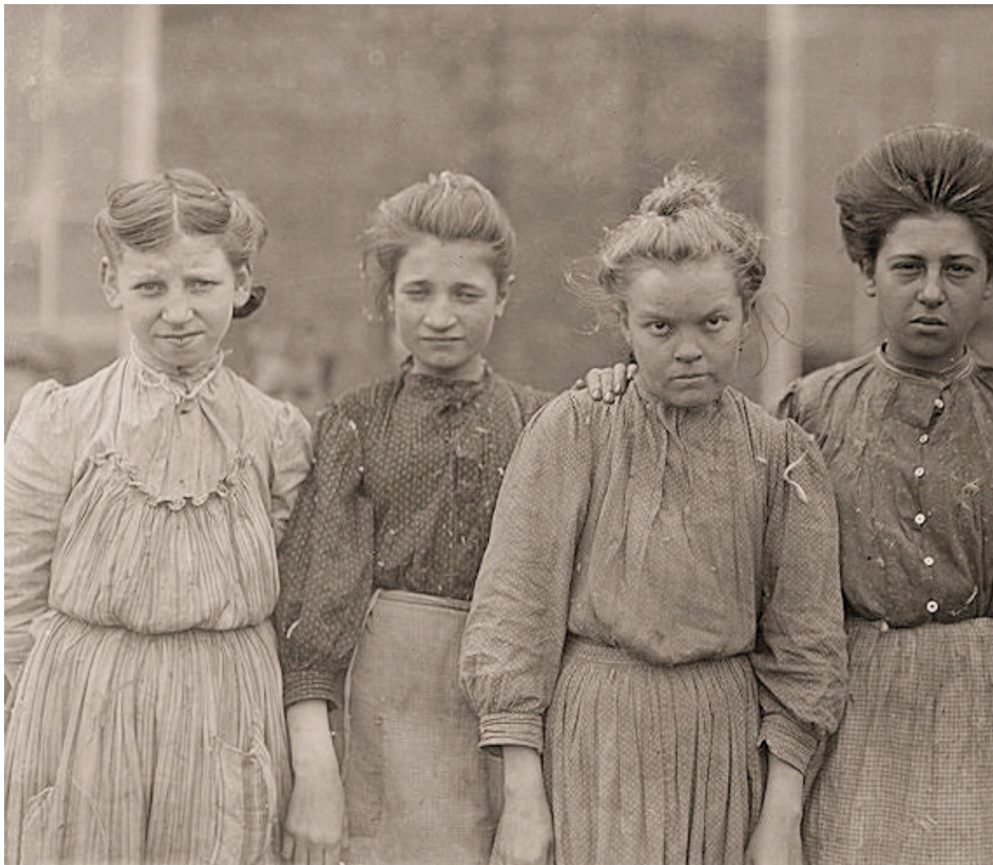
Adolescent girls from Bibb Mfg. Co. in Macon, Georgia.