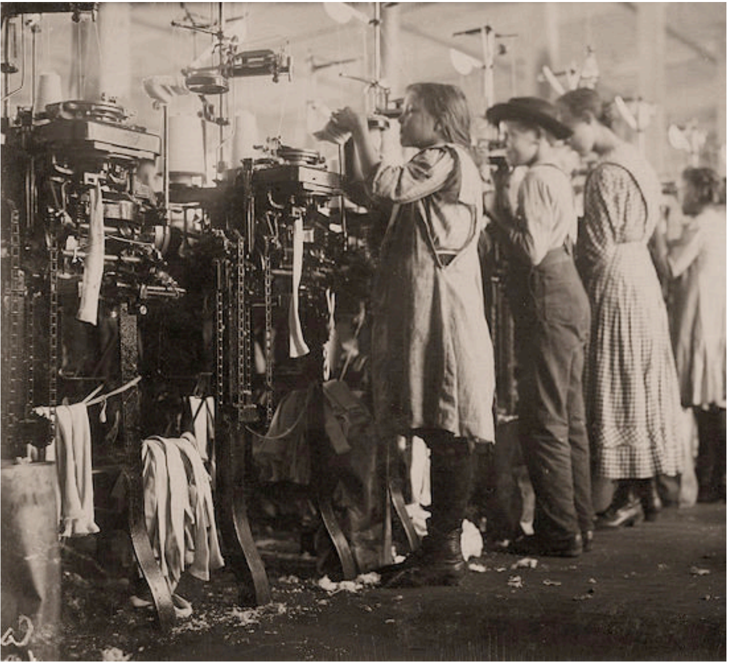
Some of the young knitters in London Hosiery Mills. London, Tennessee.